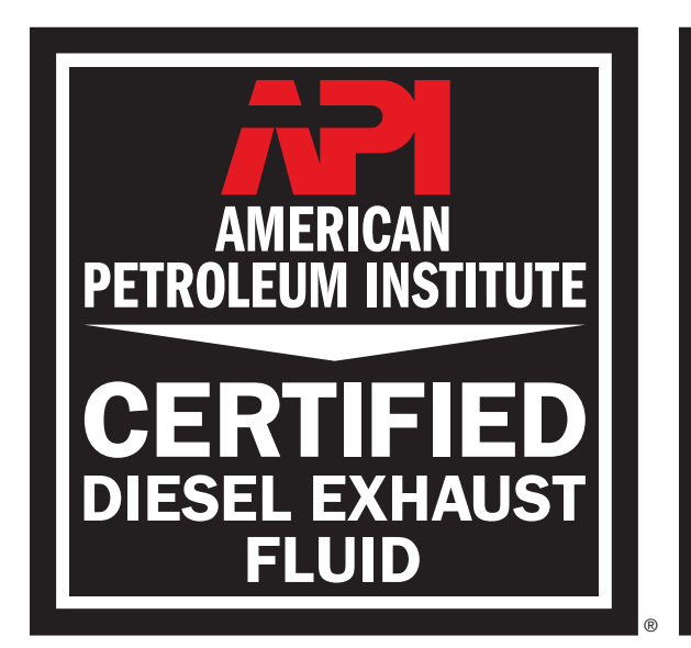
Figure 2 API Marine Diesel Exhaust Fluid Certification Mark

API Diesel Exhaust Fluid Certification Mark