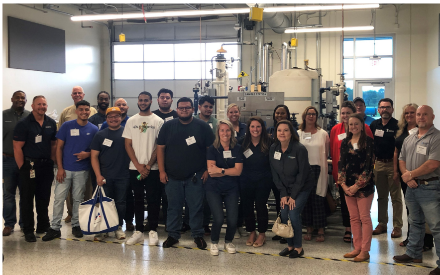
Students at San Jacinto College take a break from job-readiness training through API's SkillsReady program.

SkillsReady by API is a training program that promotes job readiness for natural gas and oil industry careers. Bringing together educators and community leaders, the skills-based education in diverse communities prepares the next generation of energy workers for on-the-job knowledge developed in partnership with API member companies. Curriculum includes safety procedures, hydrocarbon basics, equipment use, supply chain fundamentals, facility operations and more. Graduates obtain an API Certificate validating their knowledge of industry operations to help position them to enter the industry workforce.